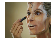
Canadian Artist Transforms Into Comic Characters Online