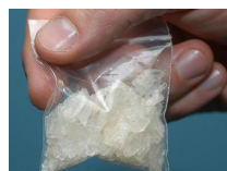
Ebola Meth? Police Joke Nets At Least 1 Drug Arrest