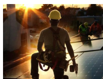
Catching the Sun