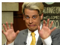
Gay Breitbart Columnist Says LGBT Activism 'Makes Me Want To Go Out And Bash Queers'