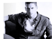
Fat-Shaming Meme Sparks Wentworth Miller to Open Up About Suicide